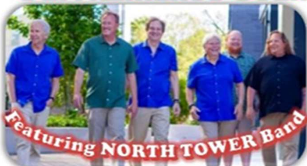
Featuring NORTH TOWER BAND